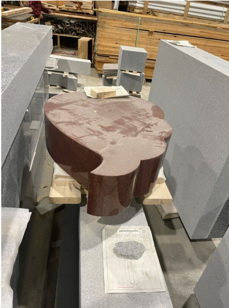
Monument Flame being finished at Rock of Ages facility.

Our Goal is to preserve the AMMO Heritage with a Monument that depicts or symbolizes the efforts of the USAF Munitions Systems Career Field personnel and their achievements.