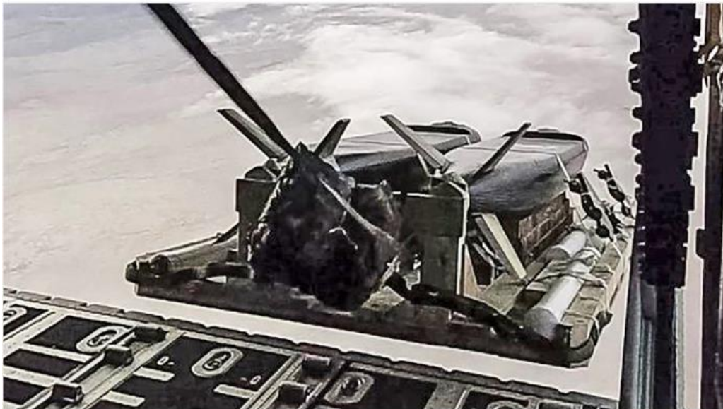
Two CLEAVER munitions on a single pallet exit the back of an Air Force Special Operations Command MC-130J Commando II special operations transport during the January test at Dugway Proving Ground in Utah.

CLEAVER stands for Cargo Launch Expendable Air Vehicles with Extended Range and the Air Force has described this previously unseen air-launched munition as an unpowered "long-range, high precision weapons [to] destroy moving and non-moving targets."