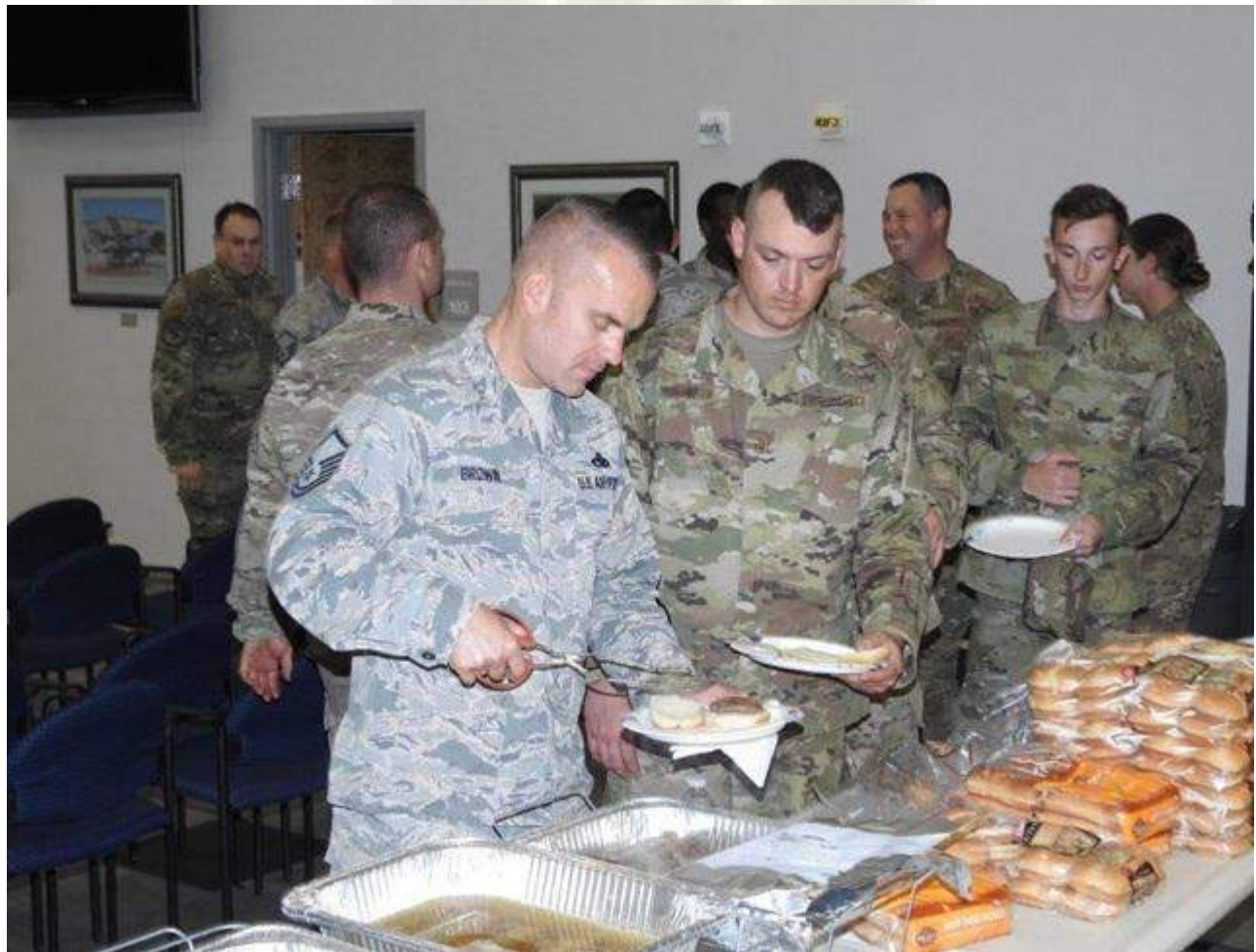
Troops Dishing Up at the June Meeting