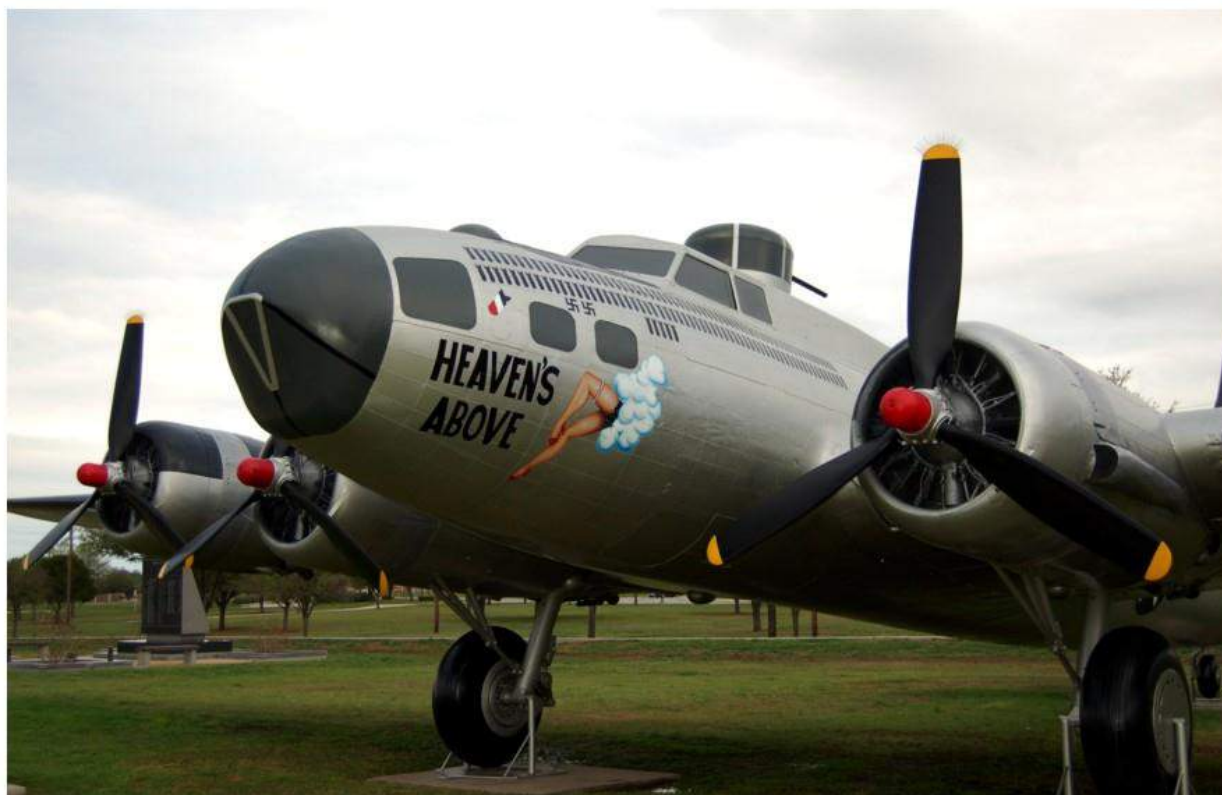
Here is a picture of the B-17 “Heaven’s Above”.