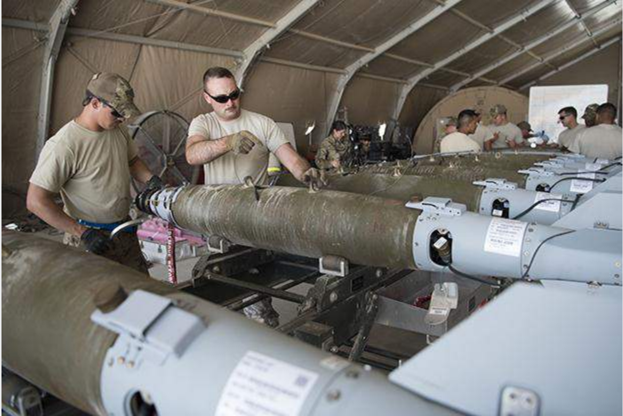
Airmen with the 332nd Expeditionary Maintenance Squadron Munitions Flight builds bombs for the F-15E at an undisclosed location in Southwest Asia on May 19, 2018.