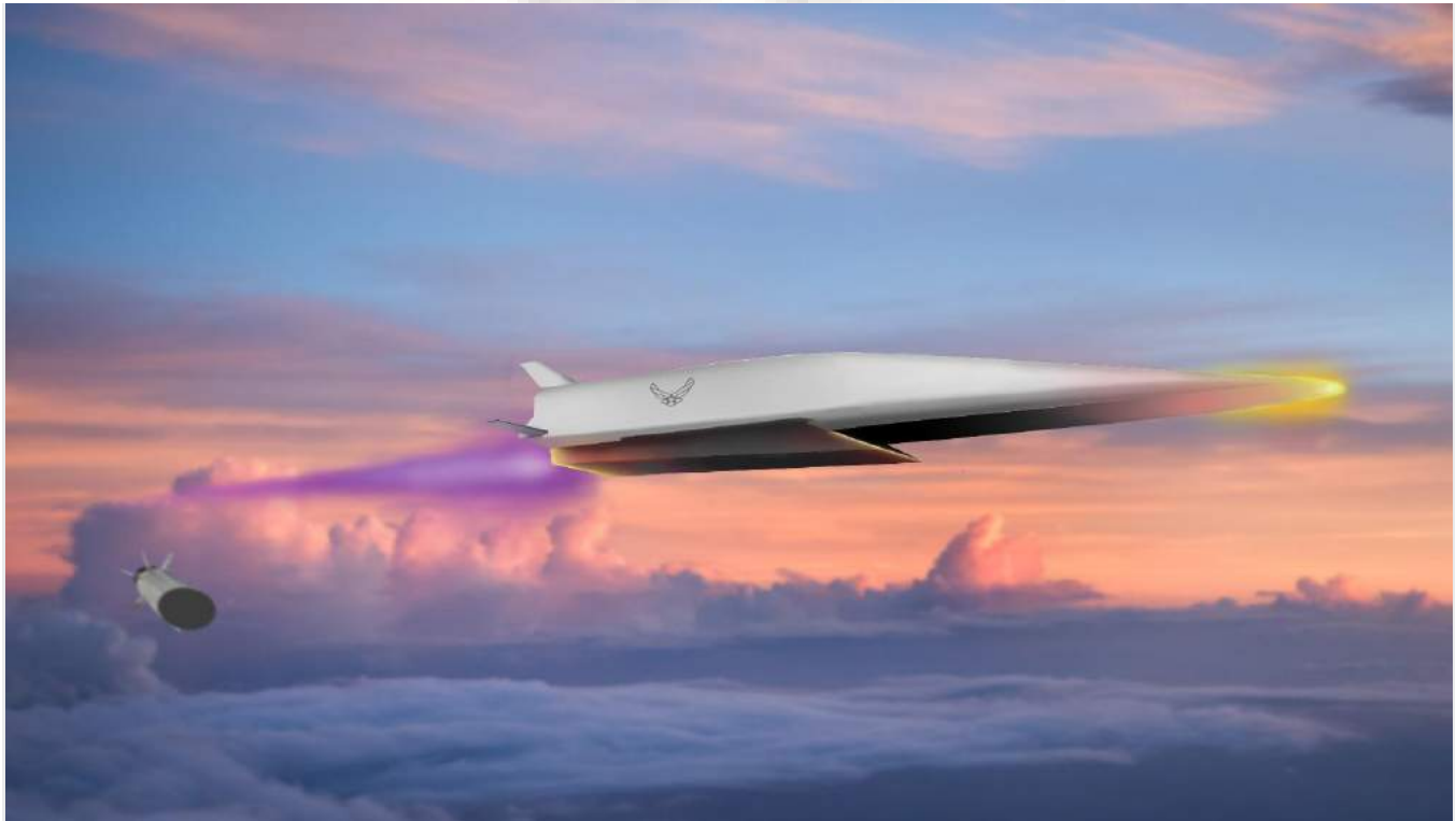
An Air Force Magazine illustration of a Hypersonic Conventional Strike Weapon (HCSW) or “Hacksaw” after launch from an airborne platform. Staff illustration by Mike Tsukamoto.