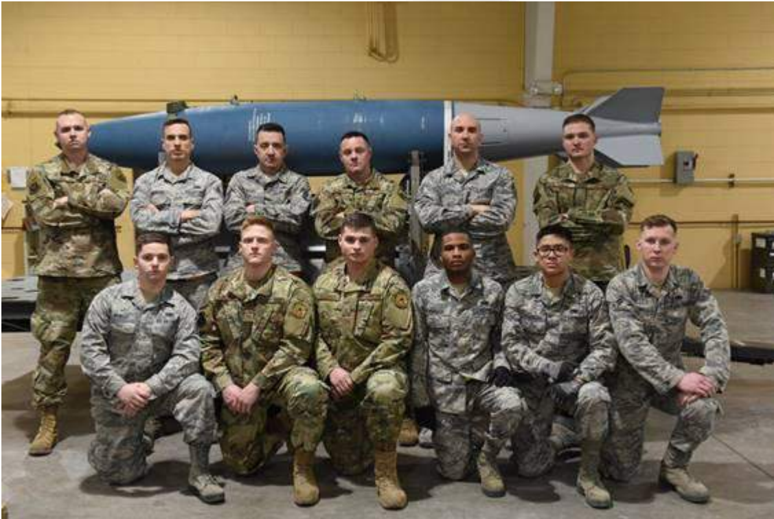
A 28th Munitions Squadron team won the Air Force Combat Operations Competition for U.S. Air Force Global Strike Command on Feb. 19, 2019. The team, assigned to Ellsworth Air Force Base, S.D., will move on compete at the Air force-level in May. The competition is used to determine the best of the best in munitions operations.