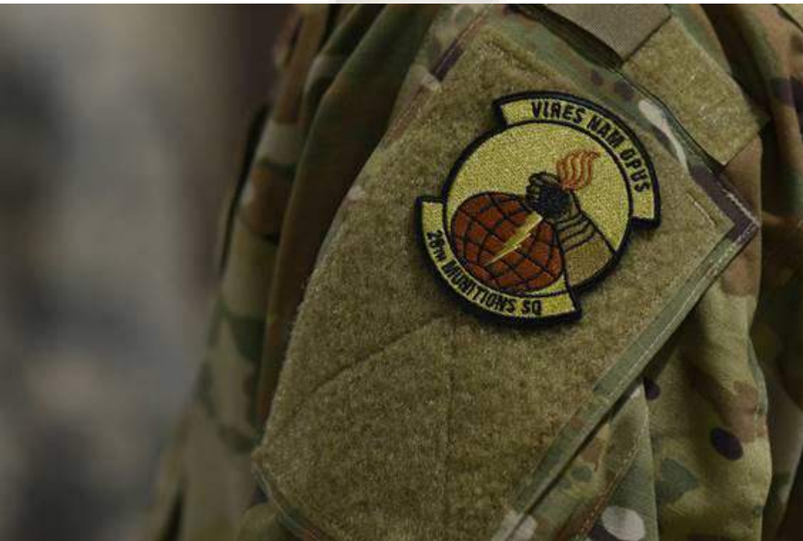
The patch of the 28th Munitions Squadron is proudly worn by a Raider Airman during a qualifying round for the second annual Air Force Combat Operations Competition on Ellsworth Air Force Base, S.D., Feb. 5, 2019. The competition is Air Force-wide and is used to determine the best of the best in munitions operations.