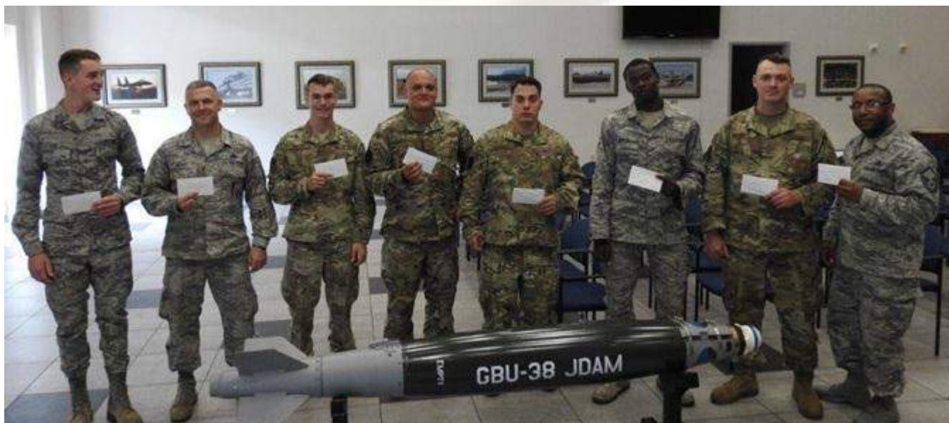
Winners of the June $25.00 Raffles