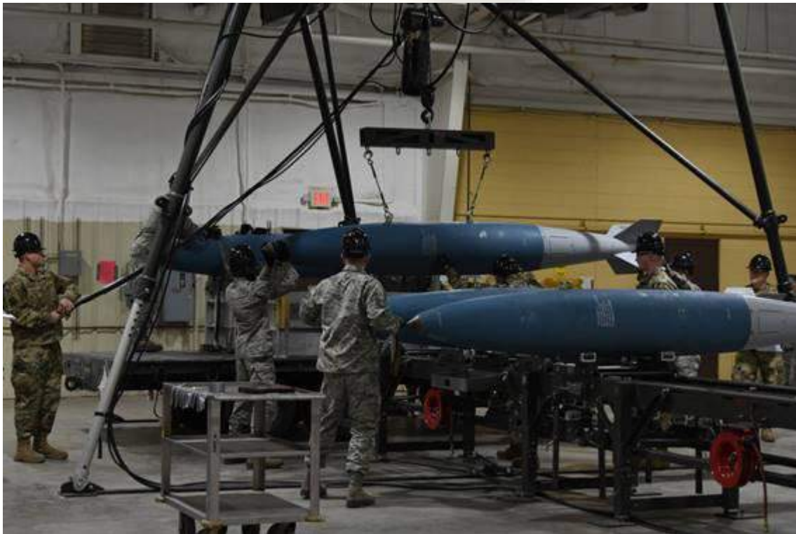
Airmen from the 28th Munitions Squadron lower a completed bomb at Ellsworth Air Force Base S.D., Feb. 5, 2019, during a qualifying round for the second annual Air Force Combat Operations Competition at the major command level. The competition is Air Force-wide and is used to determine the best of the best in munitions operations.