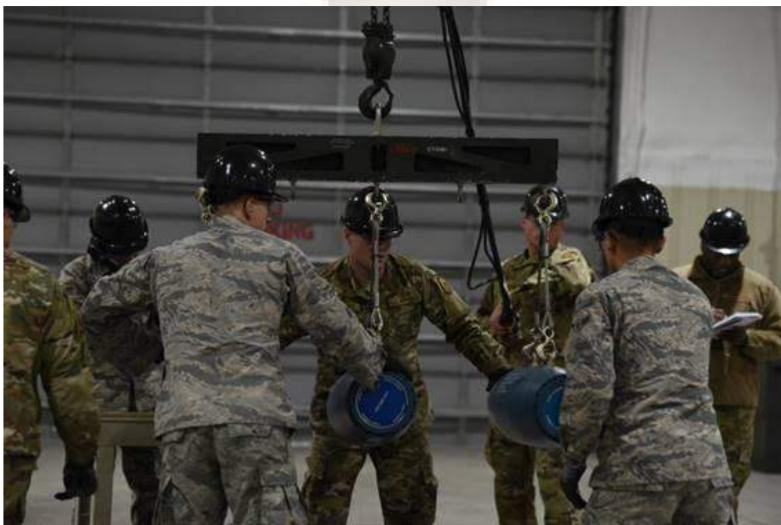
A team of Airmen work together to bring three small-diameter bombs onto a conveyer during the qualifying round of the second annual Air Force Combat Operations Competition on Ellsworth Air Force Base, S.D., Feb. 5, 2019. The competition is Air Force-wide and is used to determine the best of the best in munitions operations.