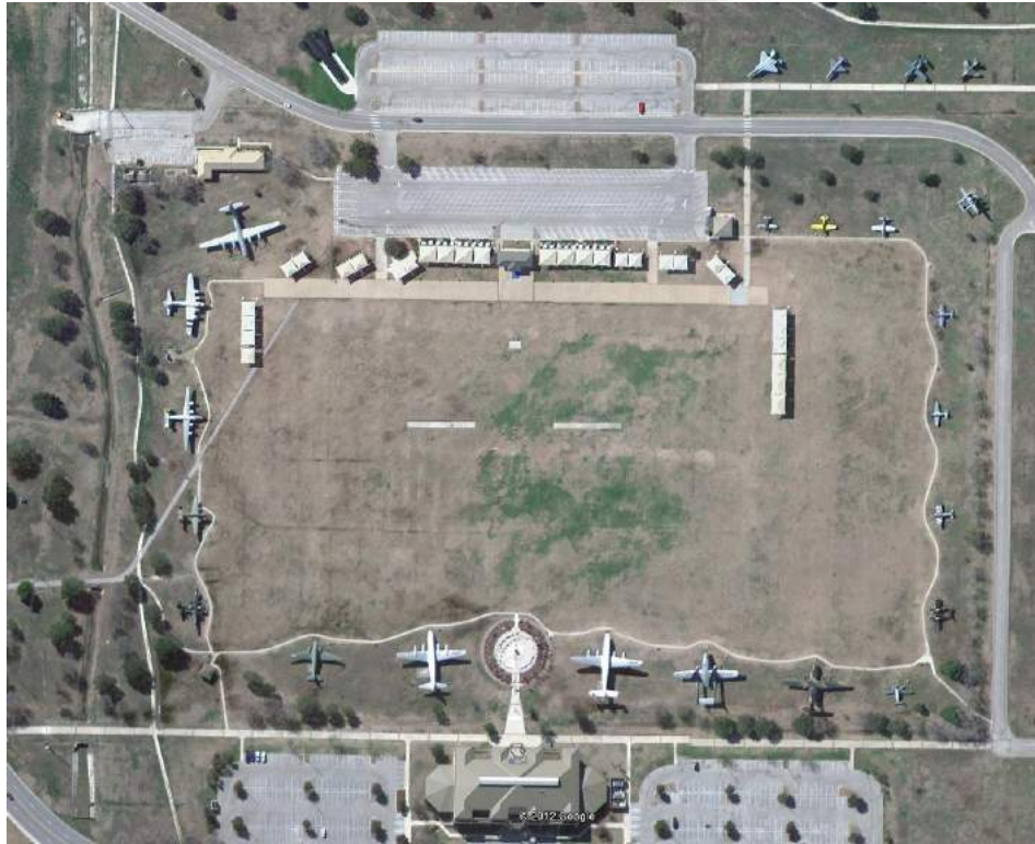
The B-17 is in the top left corner of this picture; note: this dated picture shows the old sidewalk which has been replaced with a wider ADA compliant pathway made up of pavers.