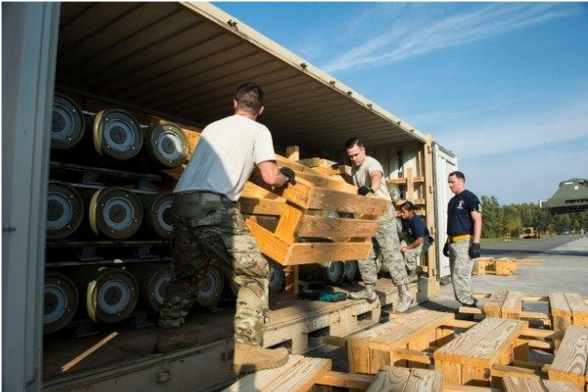
U.S. Airmen assigned to the 86th Munitions Squadron unpack a fresh shipment of munitions on Ramstein Air Base, Germany, Oct. 19.