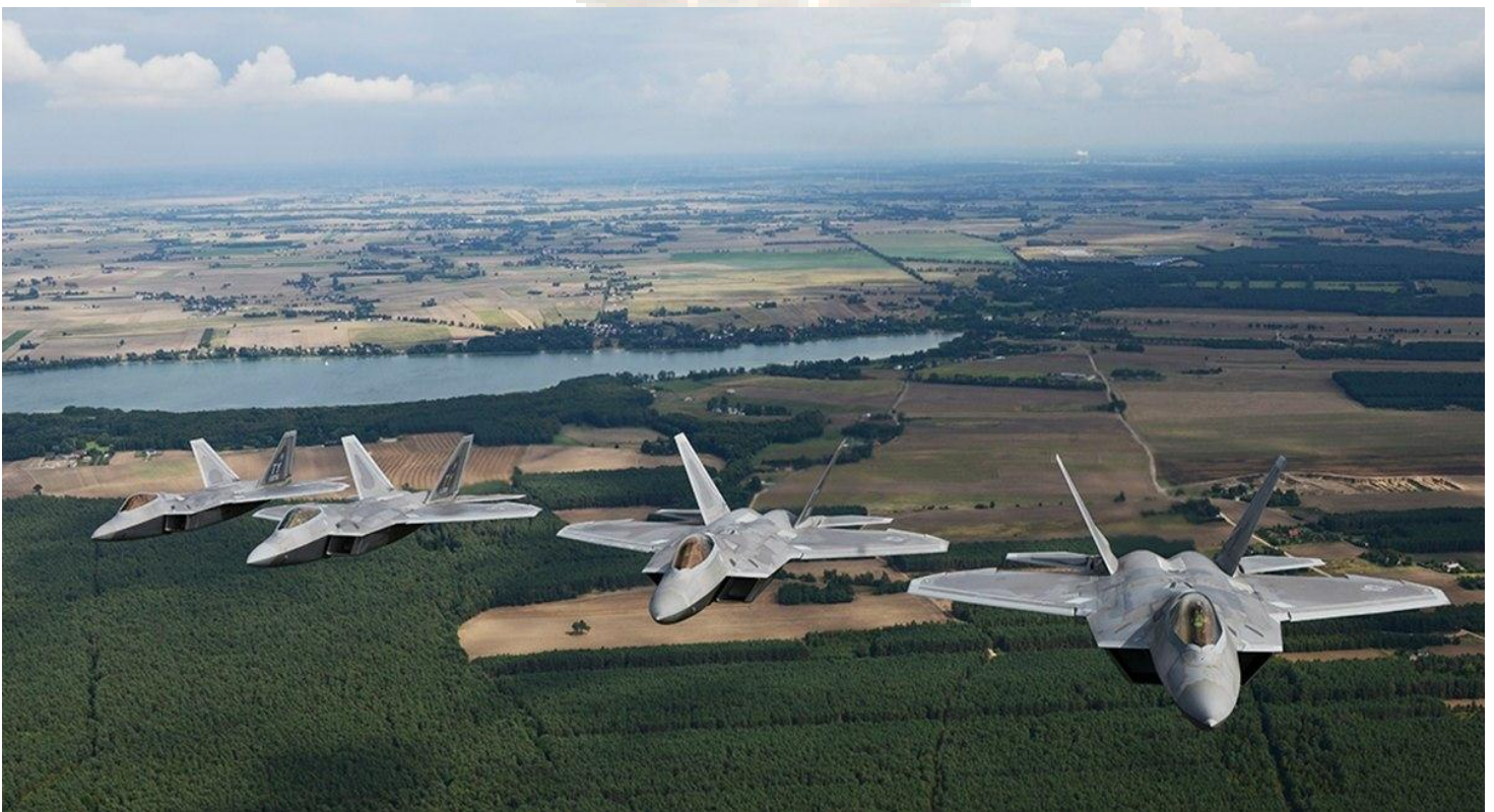
Four F-22 Raptors flyover Warsaw, Poland.

Source: https://www.airforcetimes.com/news/your-air-force/2018/10/30/rearming-europe-us-air-force-receives-largest-ordnance-shipment-in-decades/?fbclid=IwAR2ryIguhEoR4saxlI-AQwAuG6JrtcJj6eTqCJNQRUpw1od2yeSxXZhNxHo