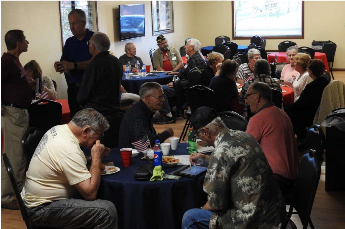
Reunion attendees meet and greet in the hospitality suite during the Branson Reunion.