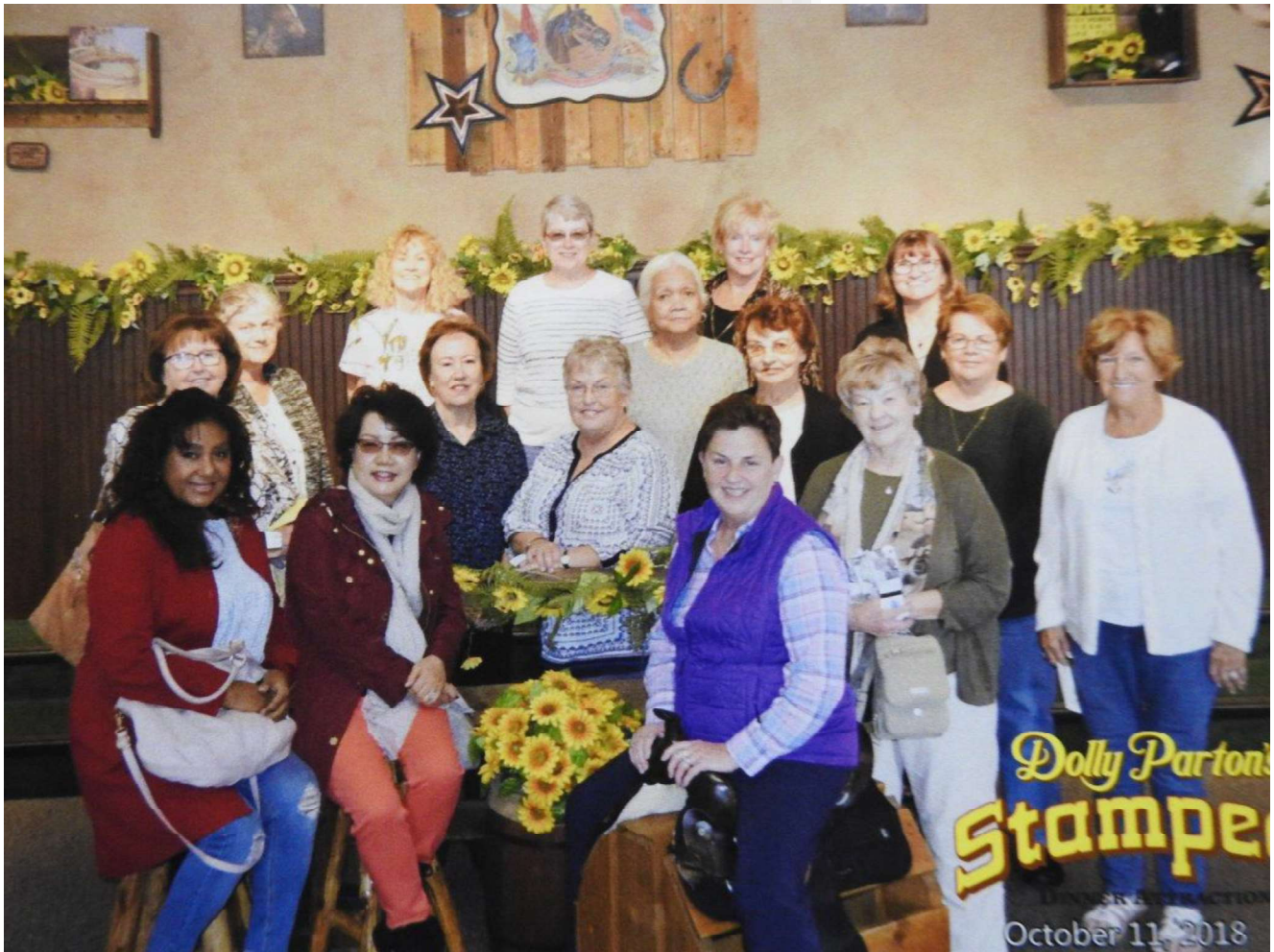
The Commanders in Chief on the Dolly Parton Stampede Outing