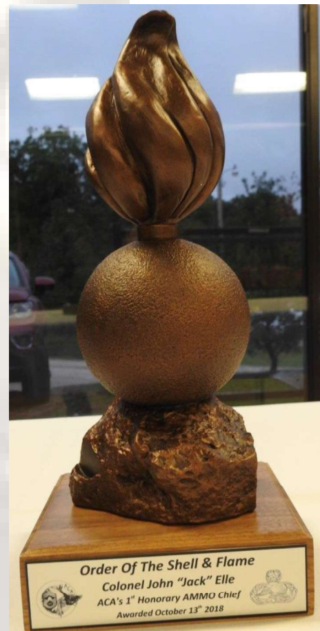
Order of the Shell & Flame Trophies