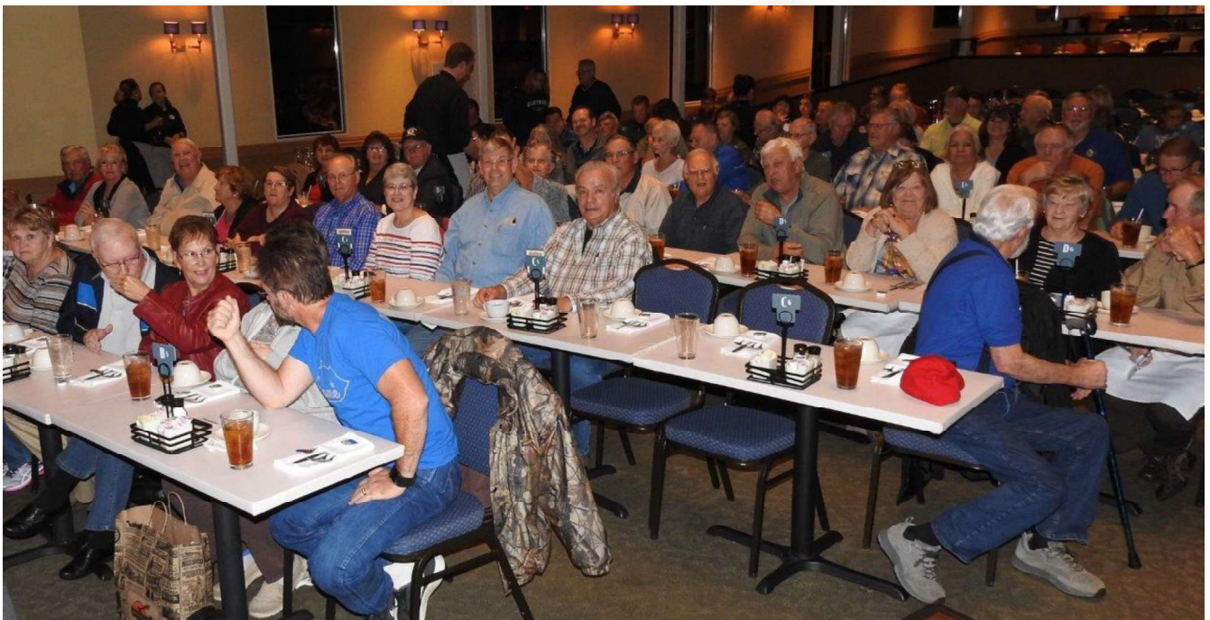
The entire Reunion Cadre at the Branson Belle Dinner "Cruise"