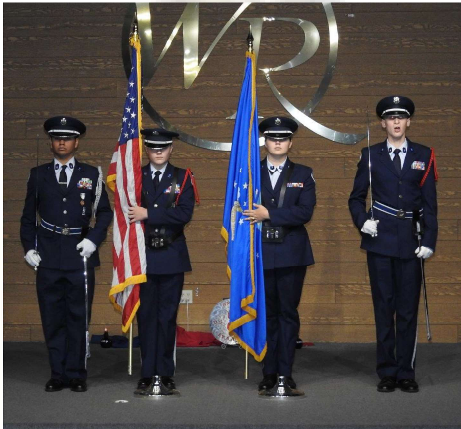
Air Force ROTC Honor Guard from the local Branson High School opens the Reunion Banquet