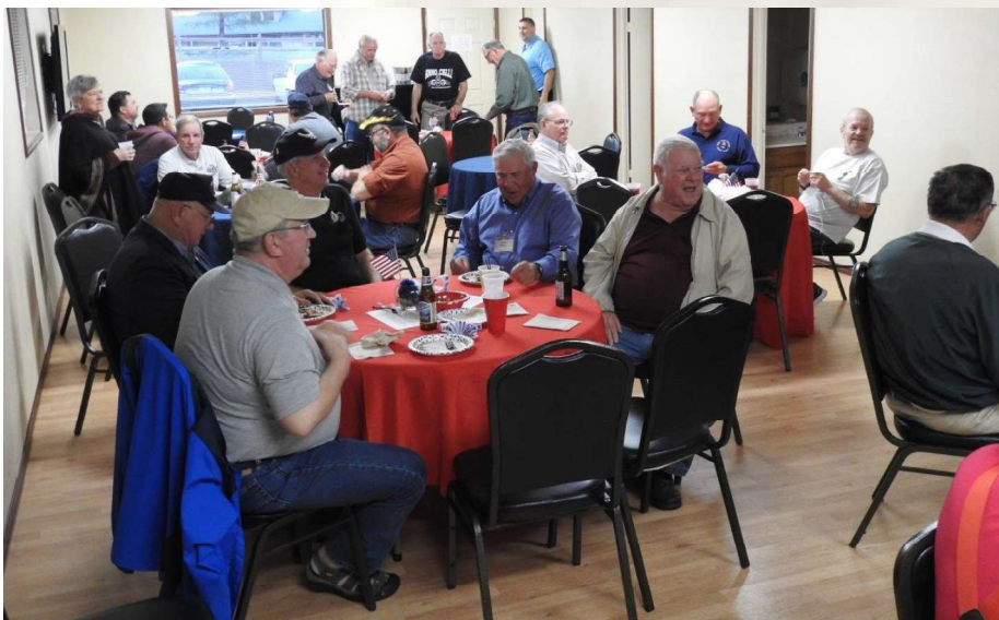
Getting ready for the ACA Business Meeting