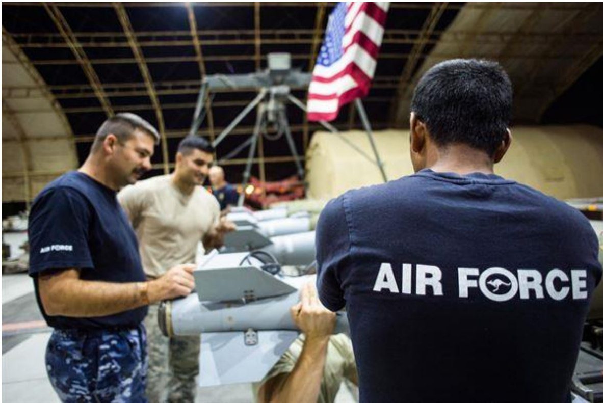
Members of the Royal Australian Air Force and U.S. Air Force construct Joint Direct Attack Munitions at an undisclosed location in Southwest Asia, Feb. 9, 2016. The RAAF has employed more than 1,600 munitions against the Islamic State of Iraq and the Levant since 2014.