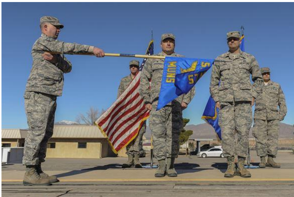
The 57th Munitions Squadron guidon is displayed after its unfurling during a redesignation ceremony at Nellis Air Force Base, Nev., Jan. 27, 2017. The 57th Maintenance Squadron was inactivated and the 57th MUNS took its place to better align the unit with its primary mission.