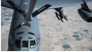
A B-52 Stratofortress refuels over Iraq on April 21, 2016.

B-52s deployed to fight ISIS have almost doubled their rate of strikes over the past four weeks, as airmen have built up the infrastructure and tactics at Al Udeid AB, Qatar, necessary for the massive bomber. Strato-fortresses began flying strikes as part of Operation Inherent Resolve on April 18, and have since flown more than 130 sorties, employing 630 precision weapons during more than 125 strikes, according to numbers Air Forces Central Command provided to Air Force Magazine . AFCENT Commander Lt. Gen. Charles Brown said during a May 26 briefing that B-52 operations started slow because there was not enough infrastructure at its deployed base, since the heavy bombers hadn't been based in US Central Command for more than 26 years. Since late May, the B-52s have flown 77 of the 130 total sorties, using