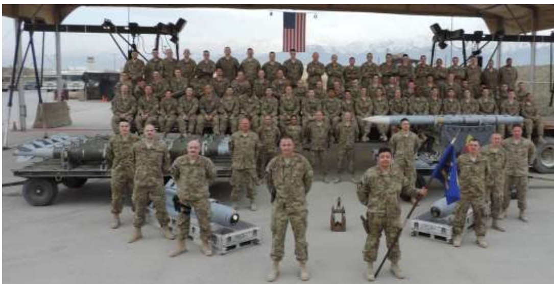
Another outstanding group of Ammo troops from Hill AFB ready to support the mission.