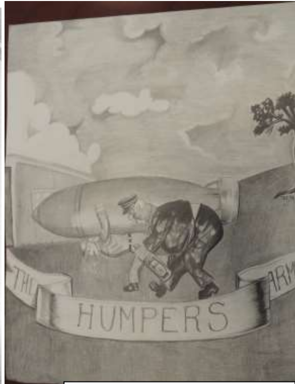
Picture of the drawing made from the picture on the left