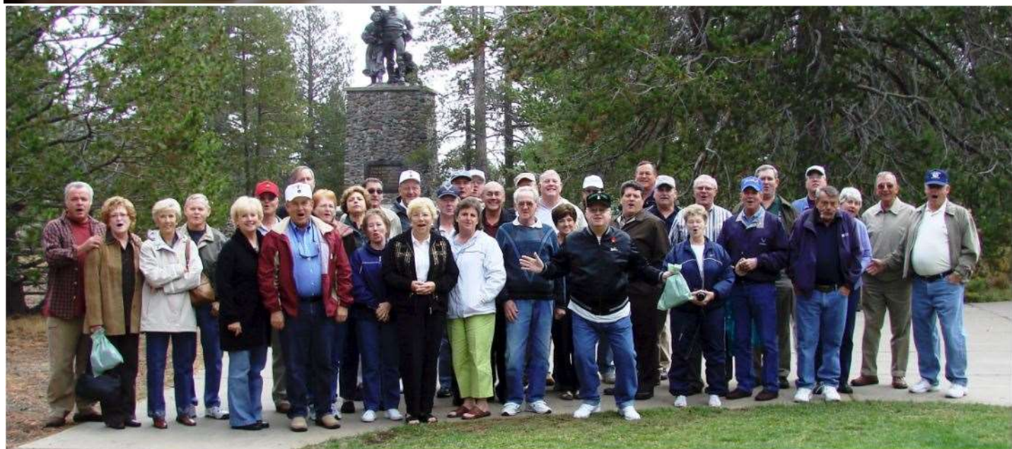
Taken at the reunion in 2006.