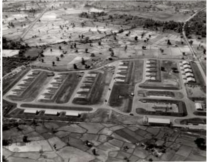
(2.) Newer AMMO area