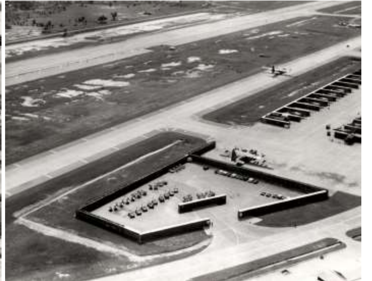
(4.) Flight line holding area