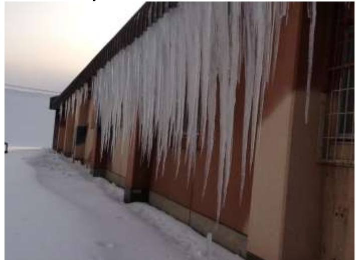
Who said Ammo wasn't a cool place to work