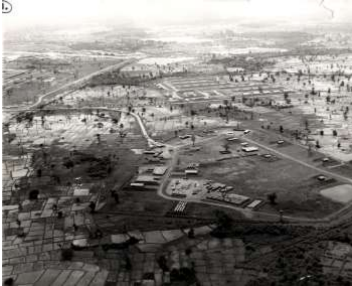
(1.) The old AMMO Area

Rich is always looking for old AMMO pictures for the S&F so I dug out some taken a little over 40 years ago when I was at Udorn Royal Thai Air Base in 1971 - 72. Included are: (1.) The old AMMO Area, (2.) Newer AMMO area, (3.) Preload facility and (4.) Flight line holding area. For the younger guys and gals who haven't been to that part of the world yet, those are rice paddies around the AMMO areas. Aircraft in the revetments are F-4's, this was during the time Capt's Richie, Feinstein and Debellvue all became the only "Ace's" from the Vietnam War, all flying missions from Udorn. Interesting times and oh by the way - - they wouldn't have done that without AMMO!!