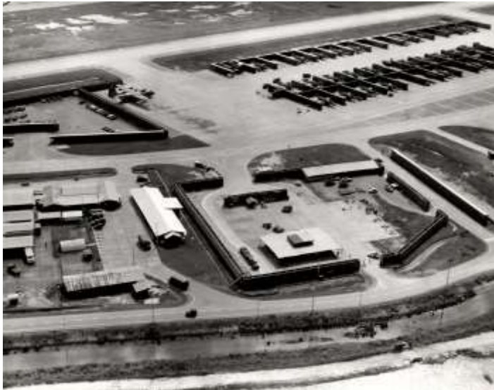
(3.) Preload facility